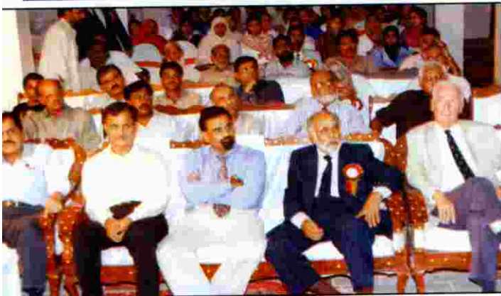
Audience of 2nd Annual Symposium. Senior Professors of Medical Universities