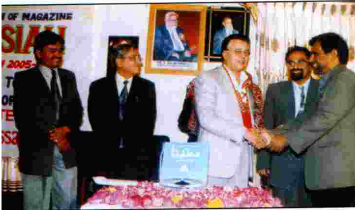
DCO Mirpurkhas inaugurating 2nd edition of Messiah