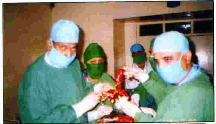
Major surgeries for poor patients is a routine at MMCH